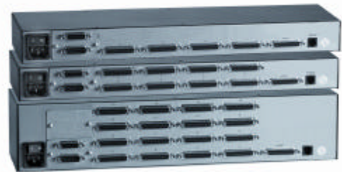
Rear view - 1 x 4, 1 x 8, 1 x 16 with optional expansion cards installed